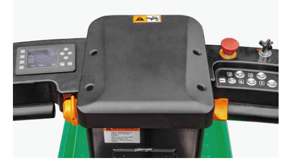
The advanced AC control system performs accurate, stable and efficient control. The CANBUS bus structure makes the communication of the vehicle faster and more reliable.