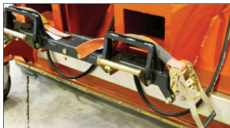
3-dimensional floating suspension